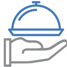
Food and beverage