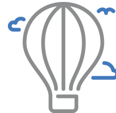
Recreation and entertainment