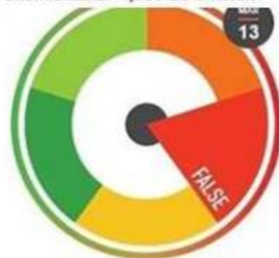
False: Salvini: 'My government will repatriate 100,000 migrants per