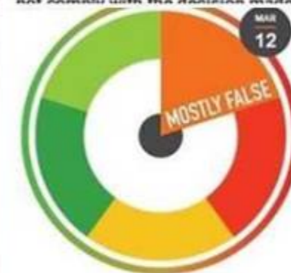
Mostly false: "Sign EU-petition to