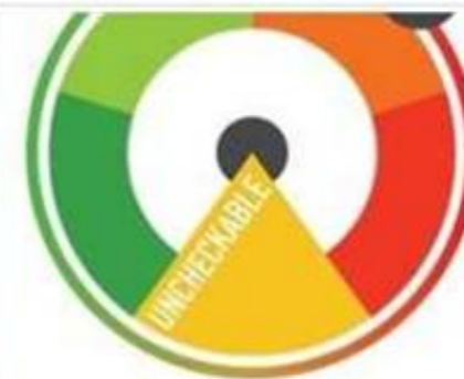
Uncheckable: "The addendum to the EU-Morocco Agreement does not comply with the decision made