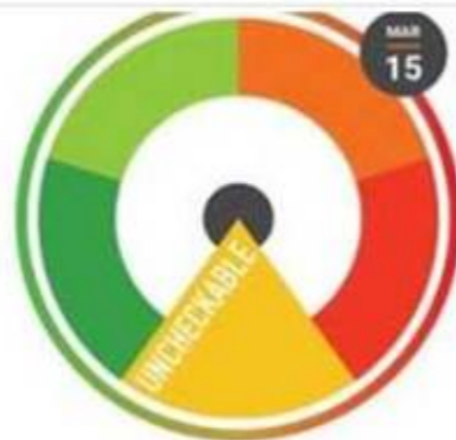
Uncheckable: '4,000 EU officials