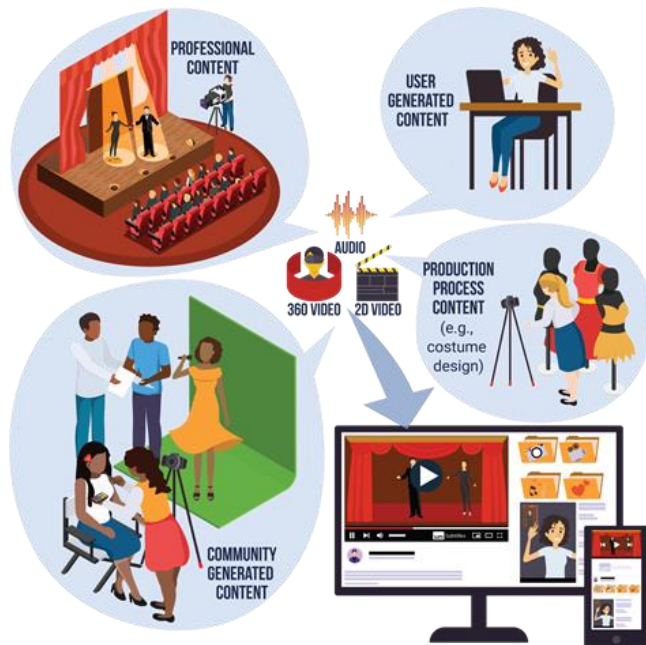
Figure 1: Sketch diagram of the Media Vault

geographical area at edge locations to ensure data is always available in closest-possible proximity to end-users. Caching of the data also minimises direct reads at the file storage system, thereby reducing cost.